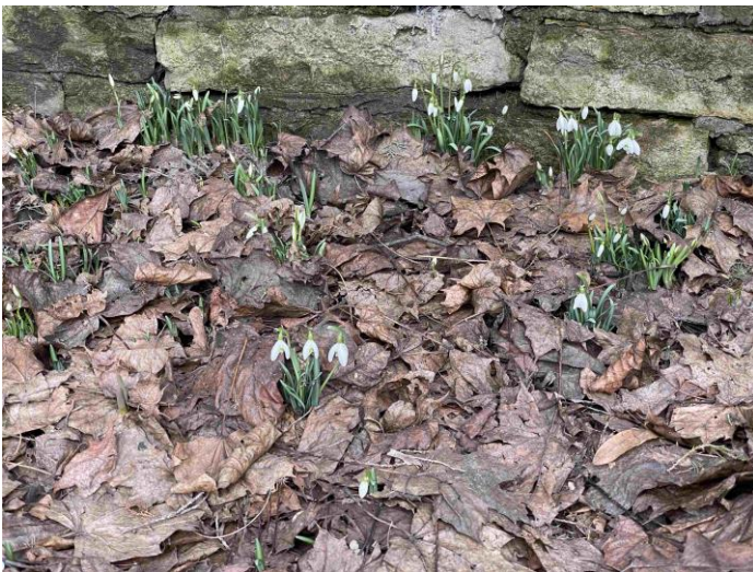
St. Martin's Garden Spring 2026