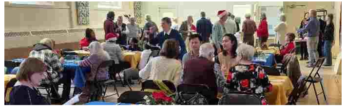
Lunch after Christmas Day Service 2025