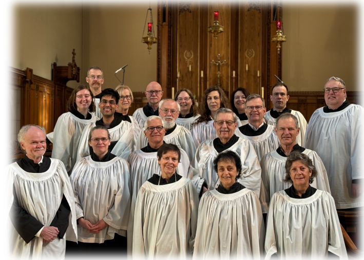
St. Martin's Choir, November 2023

"Glory to God, whose power working in us, can do infinitely more than we could ask or imagine." Ephesians 3:20