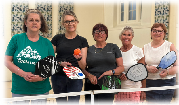
Thursday Pickleball Crew

We are now moving forward to the future with hope.