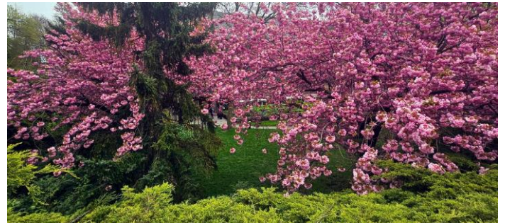
Cherry blossoms at St. Martin's, May 5, 2024