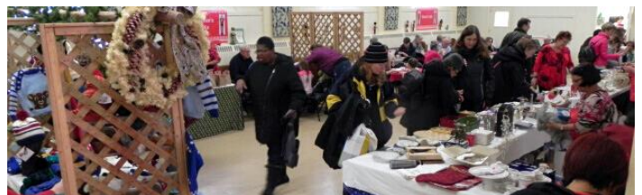
Continuing a tradition from Nutcracker Fair – this photo 2018