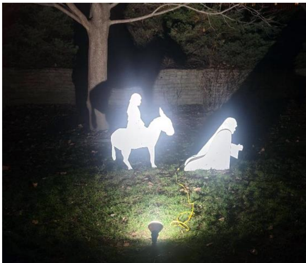
Mary and Joseph on their way to Bethlehem, St. Martin's Garden, December 6, 2022