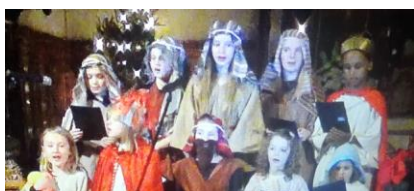
Christmas Eve Pageant – this one in 2018. There will be an in-person pageant again this Christmas Eve at 7 pm.