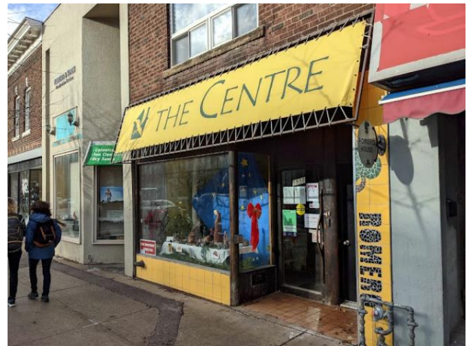
Romero House Headquarters on Bloor near Dundas West