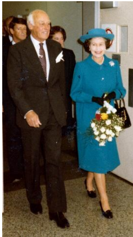
Queen Elizabeth at St. Michael's Hospital

I never actually "met" Queen Elizabeth, but I was once in the same room. The Queen visited