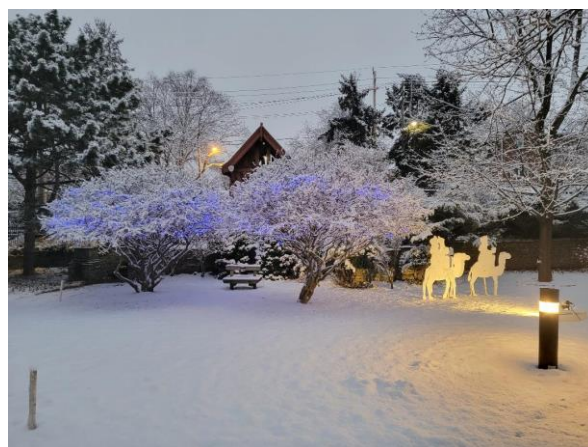
December 24, 2021, St Martin's Garden

This photo is from the St. Martin's 2023 calendar that is now available for $12 each with many more such beautiful photographs of the garden and church, a perfect Christmas present!