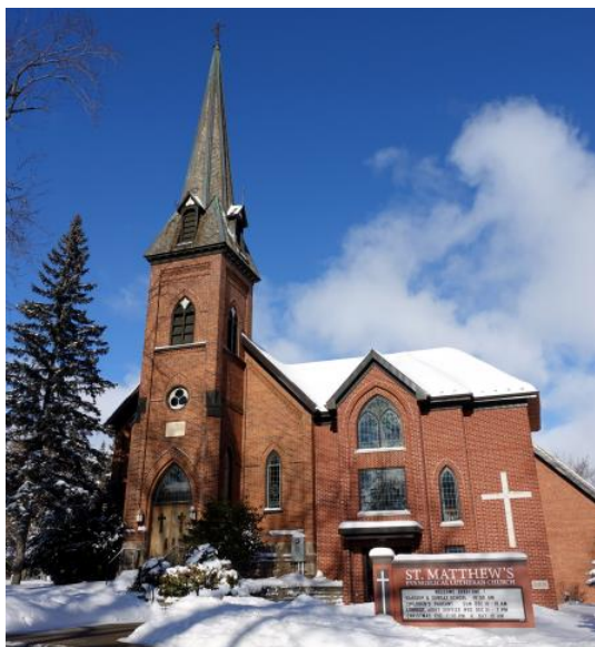
St. Matthew's Church Conestogo Rebuilt

welcoming presence to us when we're at our cottage."