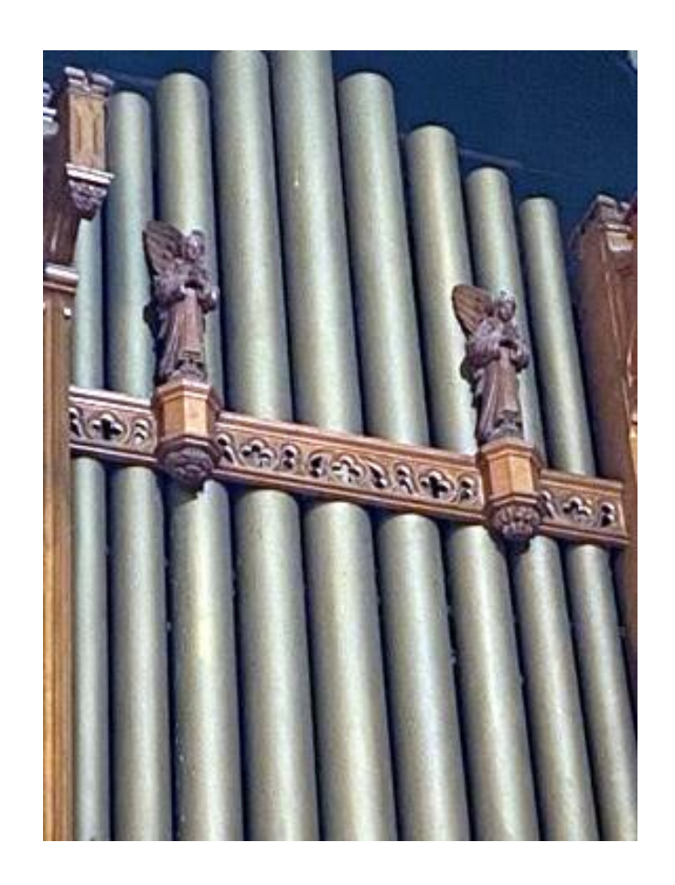
Angels on organ pipes

This is the first article on this topic in our anniversary year. In the next Lychgate, I will write more about Valley City Manufacturing Company in the years from 1929 through 2012 when it closed. It is an interesting story. I will also show more of the detailed carvings at St. Martin's and especially of the choir stalls, pulpit, and font with thoughts on the carvings.