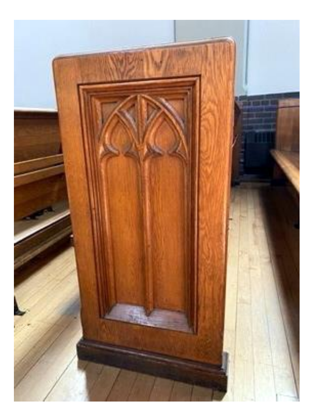
Gothic pew end