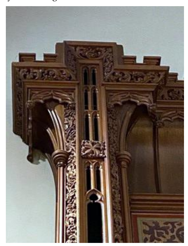
Reredos top corner