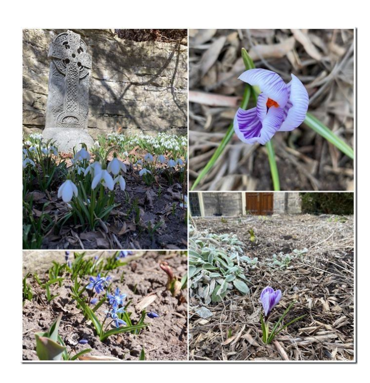
Spring flowers in the St. Martin's garden, Spring 2021.