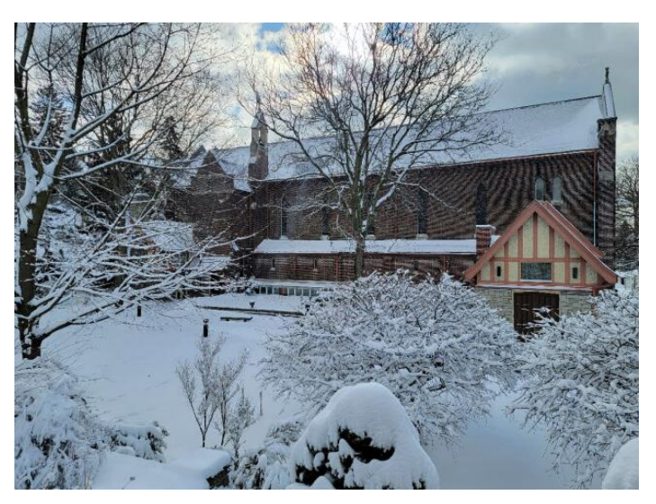
February 28, 2022 - what a winter we have had!

To do this, we will need volunteers to help in all these areas. Many have volunteered already but more are needed. This is a great opportunity to meet new friends, to introduce our parish family to the greater community, and to renew friendships that may have been suspended throughout the COVID lockdowns. Also, with more volunteers, the amount of time for each individual commitment is reduced. Don't worry – volunteers will be provided with the tools and training you need to be an effective ambassador for St. Martin's. Please note also that all COVID restrictions in place at that time will be strictly followed to ensure the safety of our visitors and our participating parish members.