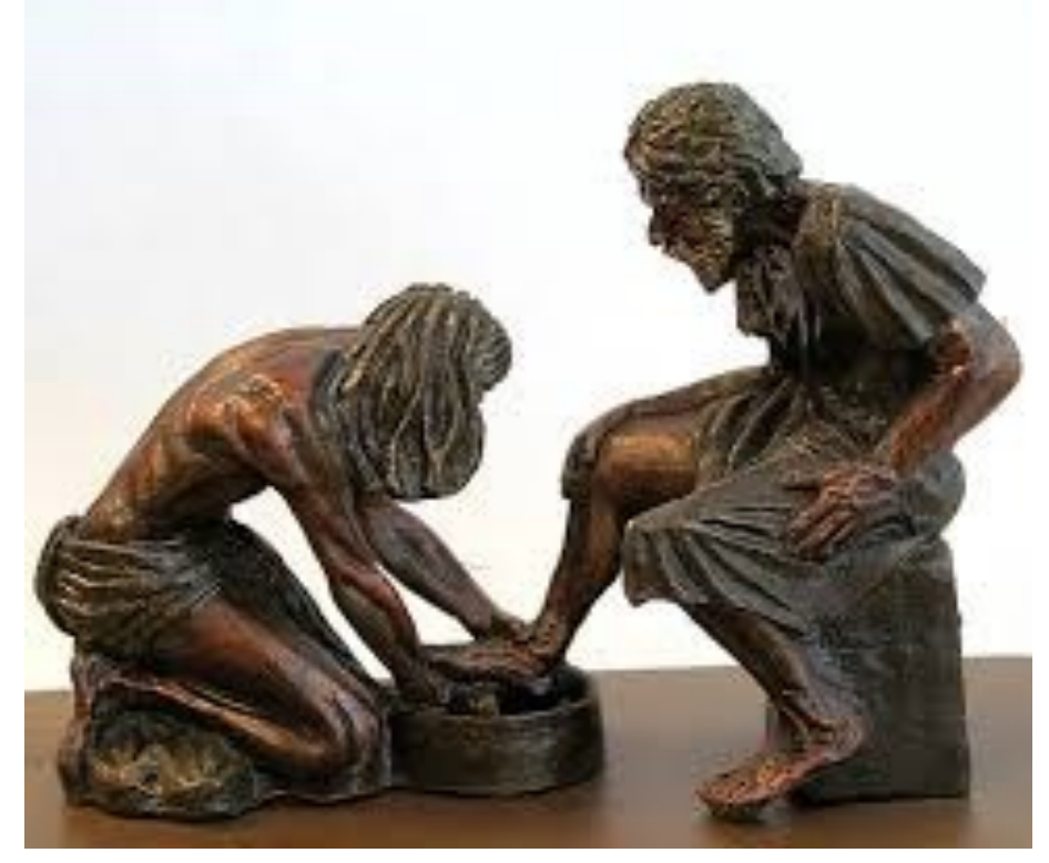
"Divine Servant" by Max Greiner

The Church of St. Martin-in-the-Fields 151 Glenlake Ave. Toronto, Ontario M6P 1E8 Church: 416 767-7491 Fax: 416 767-7065 www.stmartininthefields.ca Facebook: stmartininthefieldsTO Instagram: stmartingarden